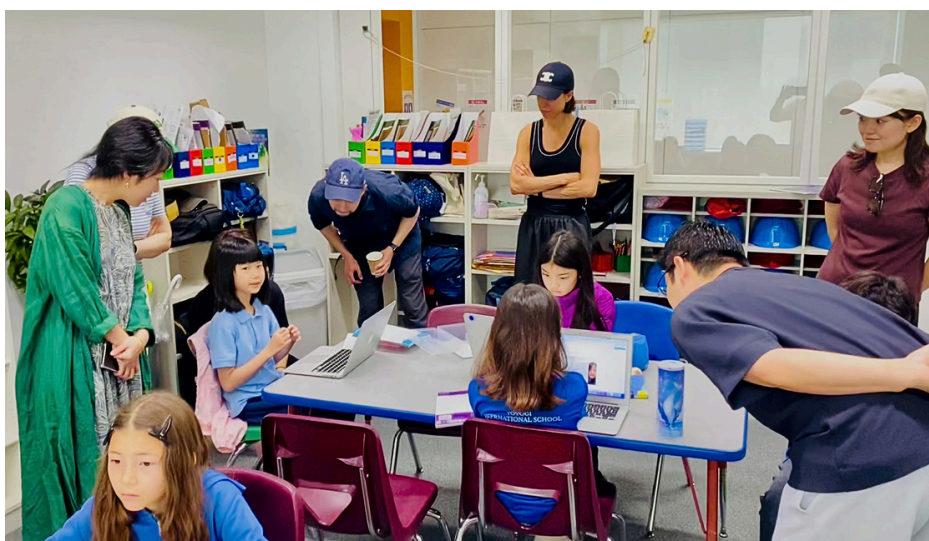
Yoyogi Friends chatting with Grade 3 Students about their writing.