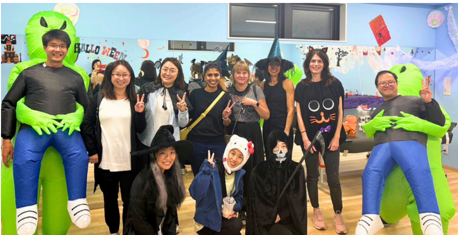
Thank you YOYOGI FRIENDS for all of your support this year!

We would like to thank the parents that participated in Yoyogi Friends discussion and activities for this school year. It has been a wonderful year of rebuilding the parent support role after COVID made it so difficult. Parents are again welcome back in to the school and our ability to create meaningful connections within our community has grown considerably. Thank You!