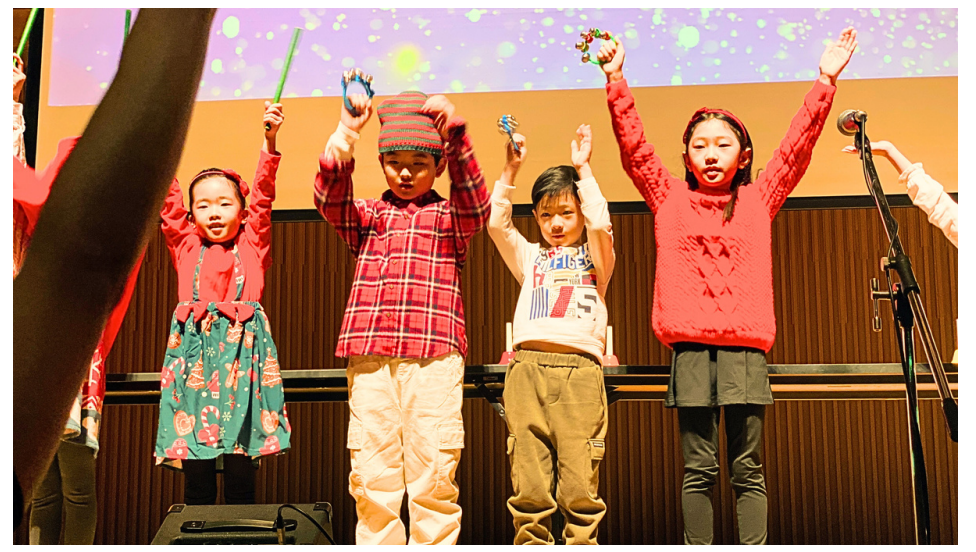
Winter Concert is on December 13 at the Olympic Center. Details to come.

On November 21, students will be dismissed at 1:30 after their lunch. This time is being used by staff to continue preparations for the CIS visit next October. We will met several times throughout the school year to reflect on our performance as a school. Parents will soon receive a survey to complete to help inform this process. Please participate and help us to grow.