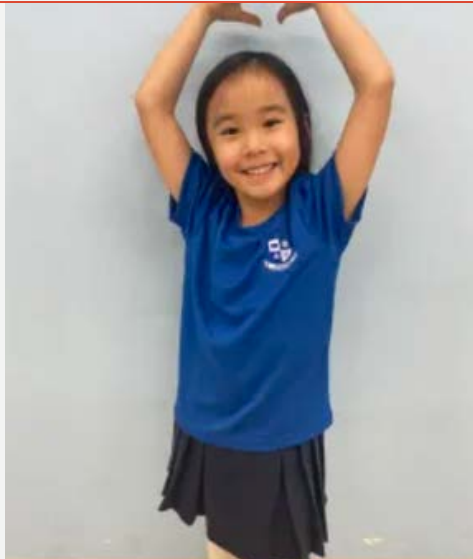
2 DARK BLUE BOTTOM

We consistently look at improving our uniforms for wear, cleaning and longevity. The new PE shirts are made of sports team materials that are easy to wash and maintain.