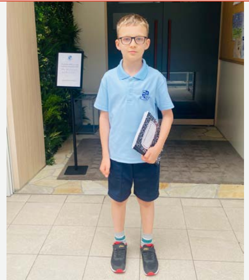
3 SCHOOL POLO OR SWEATER

This year we will enforce wearing a dark blue bottom without logo or patterns. You may purchase skirts, shorts or pants from the school or purchase your own items that meet the same standard.