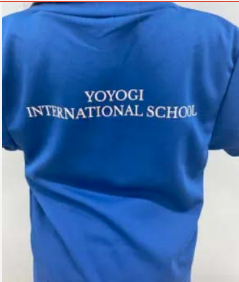
1 NEW SYNTHETIC PE SHIRTS

We have added some options for uniforms and will now require a dark blue bottom of shorts, pants or a skirt.