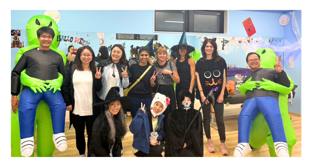
Thank you YOYOGI FRIENDS for all of your support this year!

Final Reports will be issued to students and parents in Toddle on June 11. Please take the time to review the report and read the comments with your child. Decide what to focus on in the report and how you would like to discuss the report with your child. You may wish to share only a few highlights in your own words and do goal setting with your child. Reports are kept on file and made available for future reference.