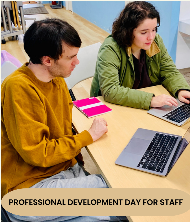
PROFESSIONAL DEVELOPMENT DAY FOR STAFF