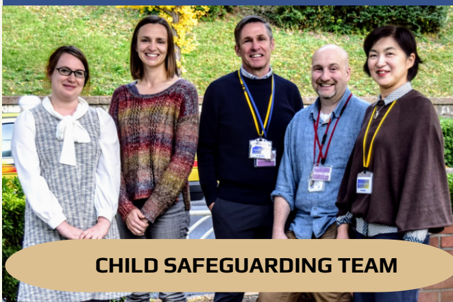
CHILD SAFEGUARDING TEAM

Term 1 Report Cards will be released on Wednesday, December 6 at noon. The reports will have marks and comments about your child's performance in the first term. The reports are meant to generate dialogue around goal setting, how we learn and growth opportunities.